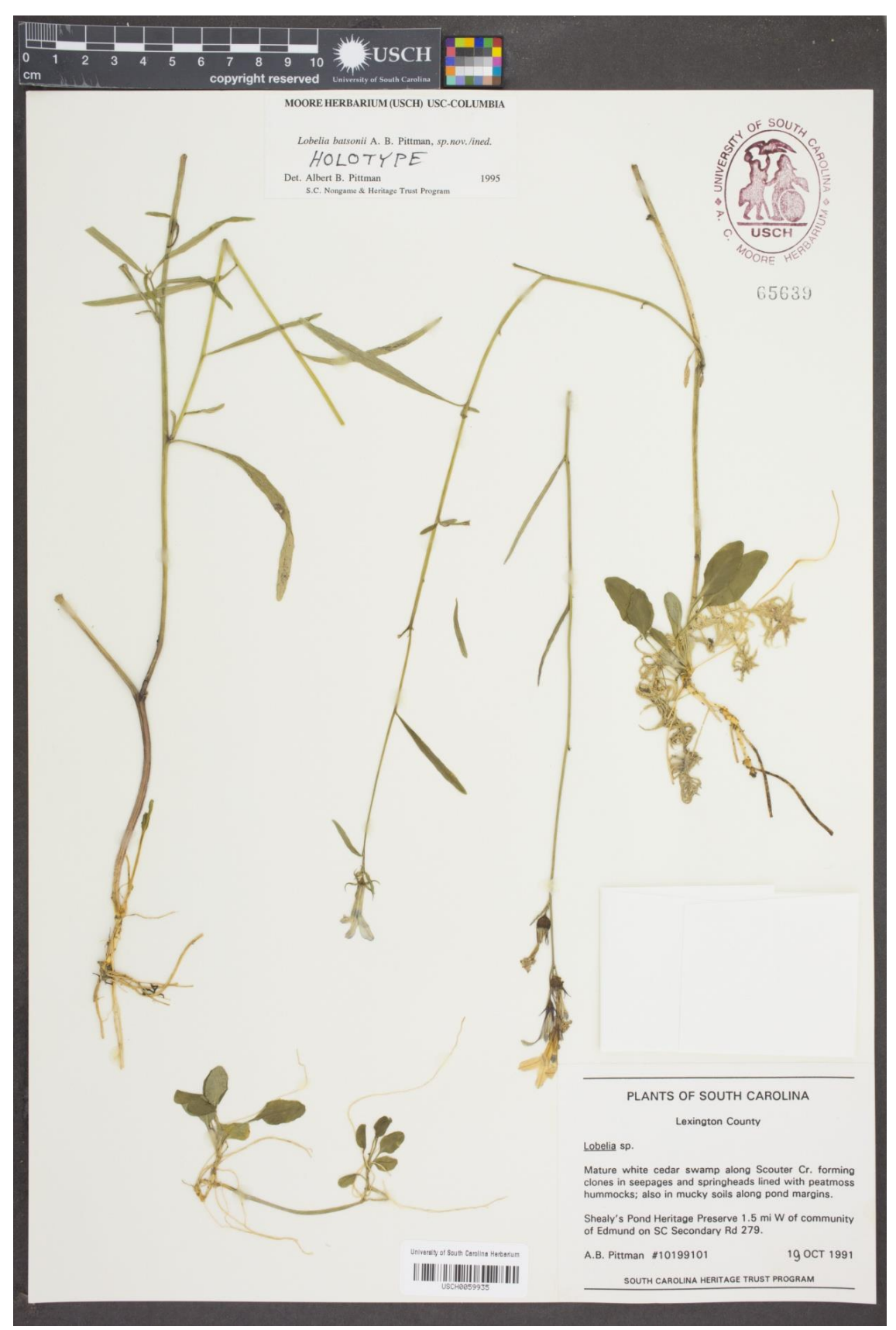
Figure 1. Lobelia batsonii. Holotype, Pittman 10199101 (USCH).