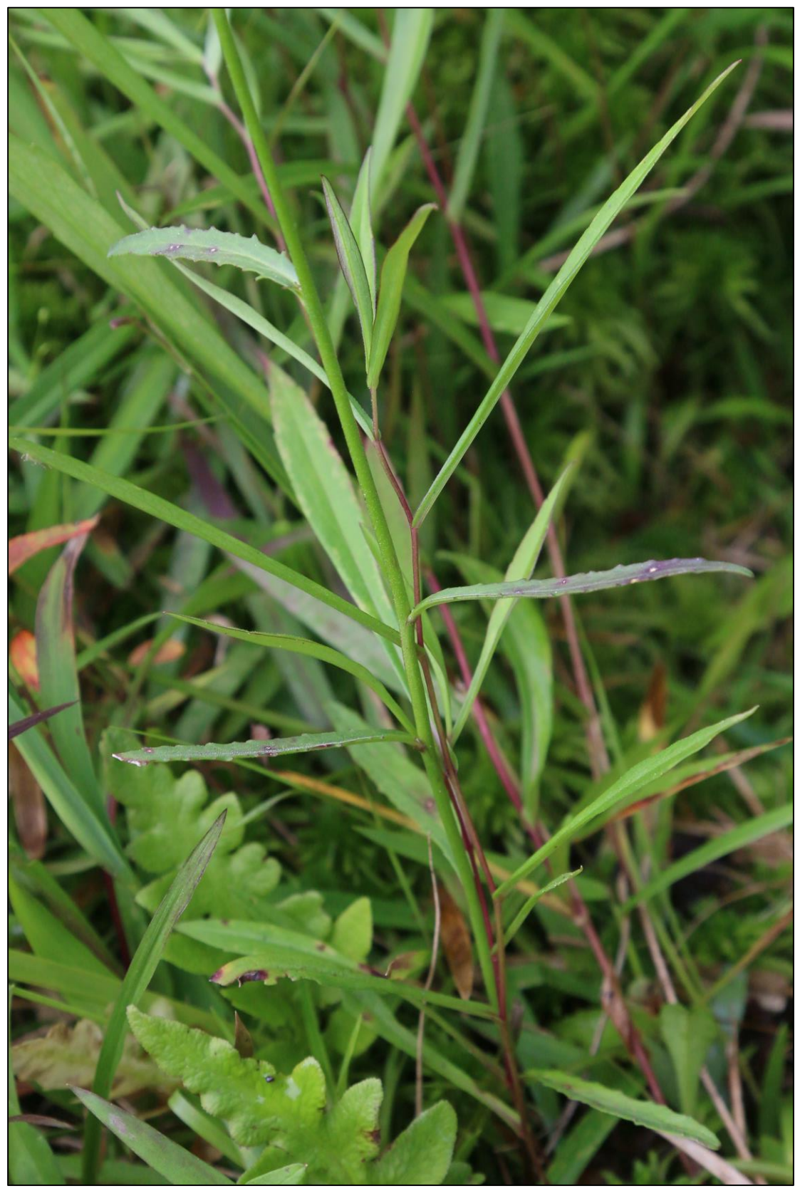
Figure 2. Lobelia batsonii , leaves and lower stem. Moore Co., North Carolina, September 2020.