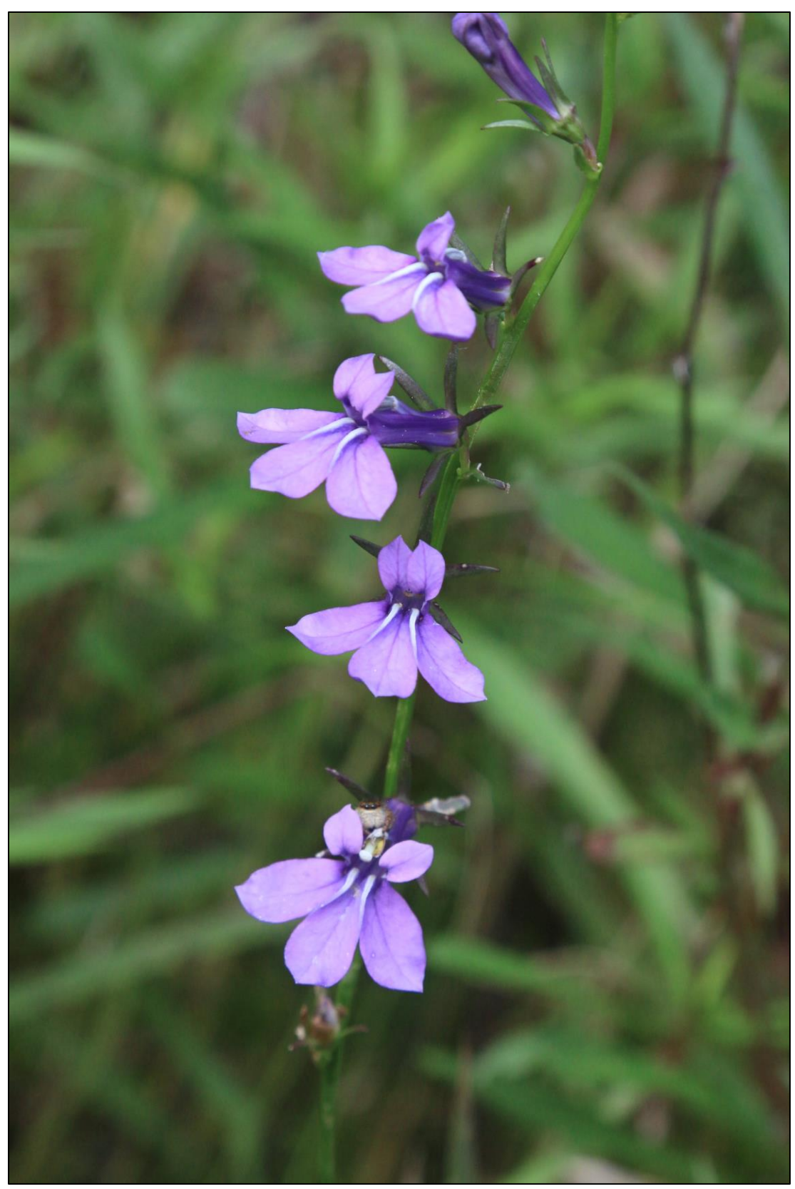
Figure 3. Lobelia batsonii inflorescence, Moore Co., North Carolina, September 2020.