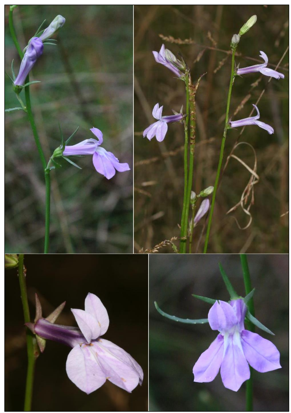
Figure 4. <u>Top</u> (left) Lobelia batsonii — short corolla tube, photo by Sorrie; (right) Lobelia glandulosa — long corolla tube, photo by J. Pippen. <u>Bottom</u> (left) Lobelia batsonii — lack of pubescence at corolla mouth, photo by Sorrie; (right) Lobelia glandulosa — pubescence extending out from corolla mouth, photo by J. Pippen.