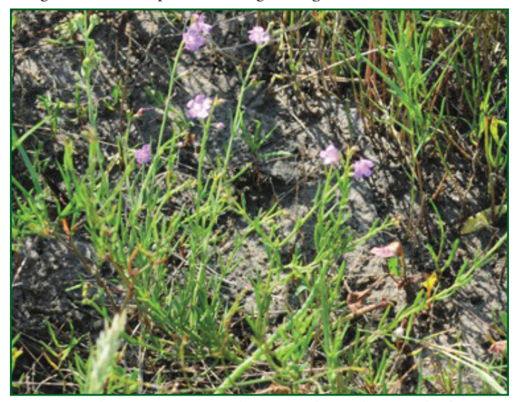
Figure 1. Agalinis maritima in a salt grass meadow, Fisherman Island National Wildlife Refuge, Virginia, in September. At the lower left is a blurred image of salt grass, Distichlis spicata, a frequent host.

Few parasitic angiosperms in the Southeast inhabit salt marshes, much less hyper saline salt flats. Bigseed dodder, Cuscuta indecora , is native in the Southeast and parasitizes marsh alder ( Iva frutescens ) and also grows inland and can be a pest on crops in the Western United States. But the only root parasite in saline and hyper saline habitats on the Atlantic Coast is Agalinis maritima , appropriately called seaside gerardia (Fig. 1). Gerardia is an older name of the genus and has persisted in the common names after species were recognized as better placed in the genus Agalinis .