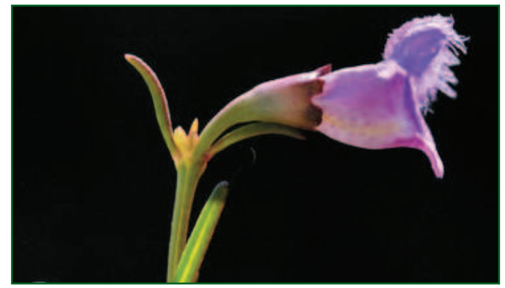
Figure 2. Flower of Agalinis maritima showing the short calyx lobes and bilabiate corolla. The flower is about two inches long.

Agalinis maritima is much branched, as tall as 2 ft. and has