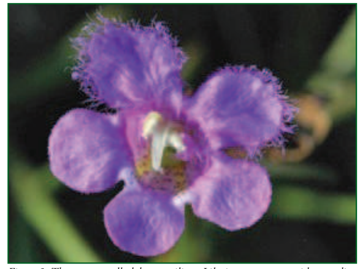
Figure 3. The upper corolla lobes are ciliate. Like its congeners, seaside gerardia has nectar guides for pollinators, generally bees.

This species, like other gerardias, likely has a broad host range though that term can be confusing because in nature relatively few hosts are parasitized. I have documented salt grass, Distichlis spicata , as a host but it also attacks other plants including dicots.