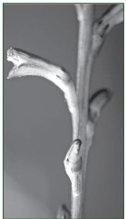
Chasmogamous flower, upper left; cleistogamous flowers below.

Beechdrops does not emerge until mid-summer when the stiff, narrow stems with their dark purple color are barely discernible in the leaf litter. Like related members of the Orobanchaceae, it lacks