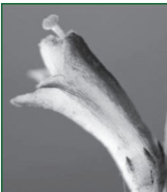
Mature flower showing exserted stigma of chasmogamous flower.

"See those beech trees," said the instructor. "Those things under it are sons-of-beeches." This is one line that helps my students remember the easily overlooked parasite, Epifagus virginiana , beechdrops. As the specific epithet indicates, it grows on the roots of beech, Fagus grandifolia . It is the only annual root parasite